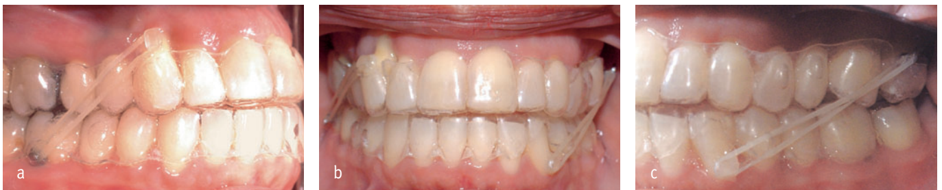
FIG 25-26 ( a to c ) Note the traditional use of midline elastics. Midlines were corrected by asymmetric Class II and Class III elastics attached to the teeth on clear buttons.