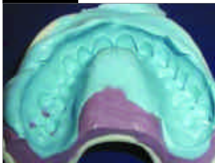
Take final impression.