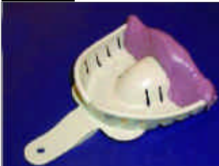
Form a post dam.