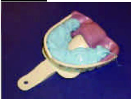
Fill tray with medium body PVS immediately.