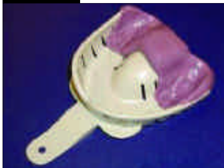
Smoosh out detail of molar impression. Do not let putty set.