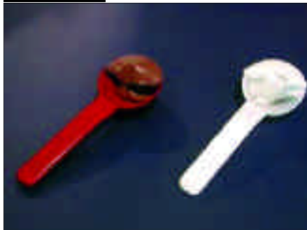
Mix putty for 30 seconds. Use vinyl gloves only.