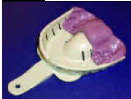
Seat tray completely and remove immediately.